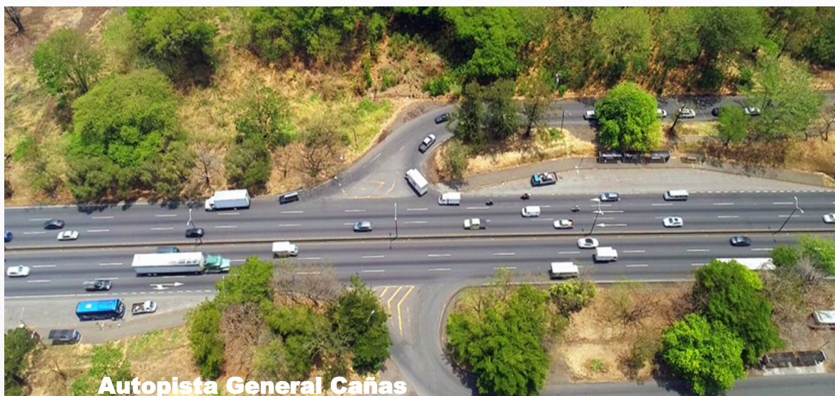
Autopista General Cañas